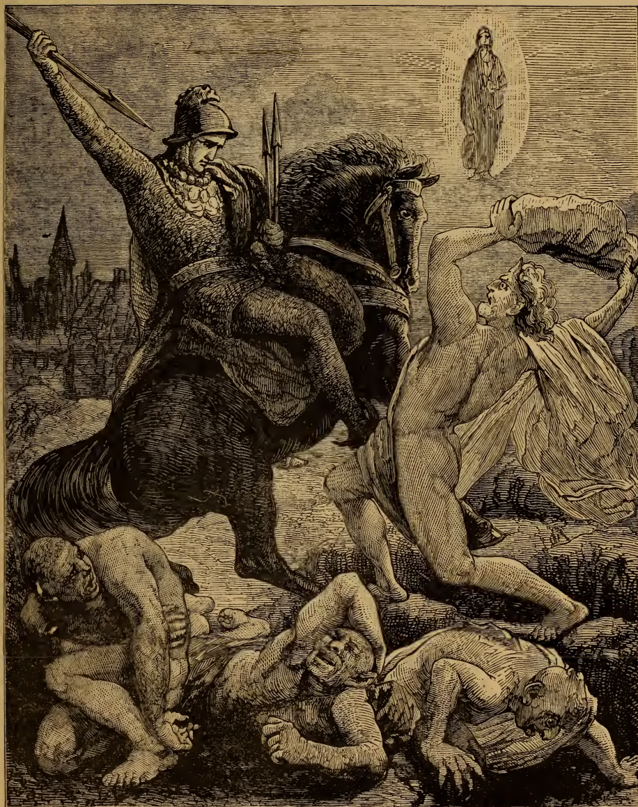
A KNIGHT ERRANT.